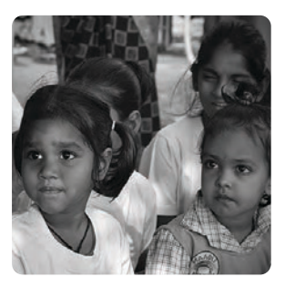
Donate As per your wish

We provide Tailoring – a free 3 months basic course for underprivileged, uneducated and needy women