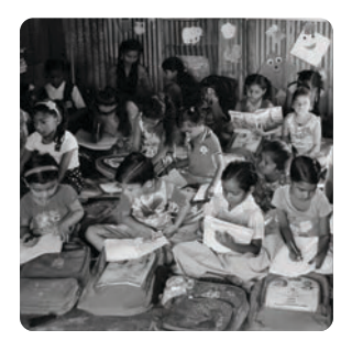
Educational Kit Total Kit cost – 2990/-

Healthcare is a part of life, we all consider it to be something we are entitled to – it is our right to have access to healthcare whenever we need it.