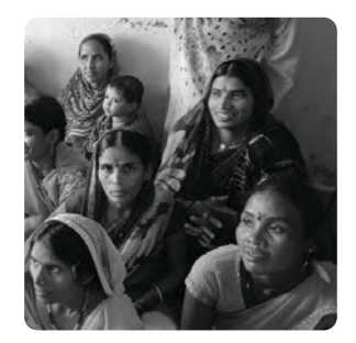
Women Empowerment Per Sewing Machine Cost ₹ 15200/-

A Scholarship is an award of Financial aid for a bright student to complete his/her further education.