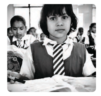
Half Year Scholarship ₹ 7500/-

Education is the social institution through which provides us important knowledge, including basic facts, job skills, and cultural norms & values.